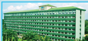
ICAR-Central Marine Fisheries Research Institute