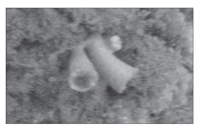
Fig. 1. Colony of Rhizopsammia verrilli van der Horst, 1922

Material examined: Twenty four colonies were observed at Wall (Lat. 12°03.313' N & Long. 092°57.730' E) of Havelock