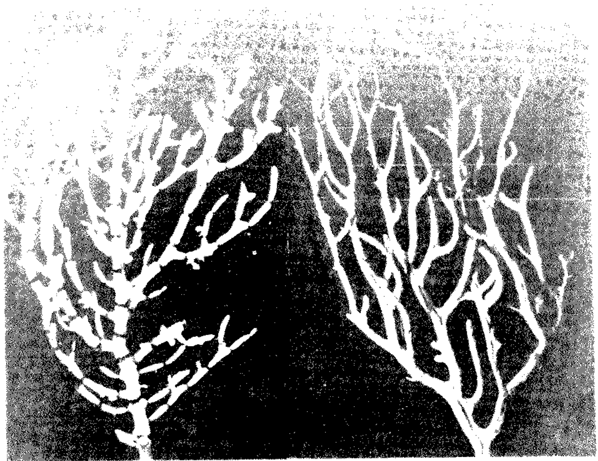
PLATE I A. Isis hippuris Linnaeus and B. Subergorgia suberosa (Pallas).