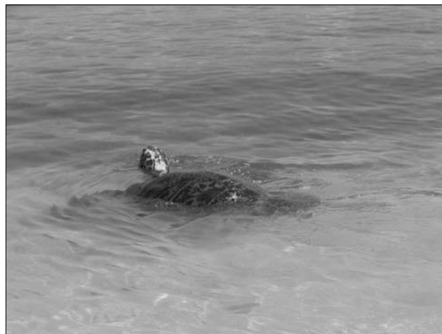
Fig.2 Green turtle swimming off Agatti Island.

lagoons of Agatti, Kavaratti and Minicoy and most of them were observed in the deeper part of the lagoon and outside the reef between the depths of 2-5 mts. Green turtles were the most abundant species and olive ridleys were observed only occasionally outside the reef or in the lagoon. Among the different islands, Agatti had the maximum number of green turtles in the lagoon followed by Minicoy and Kadamat (Tripathy et al. , 2002).